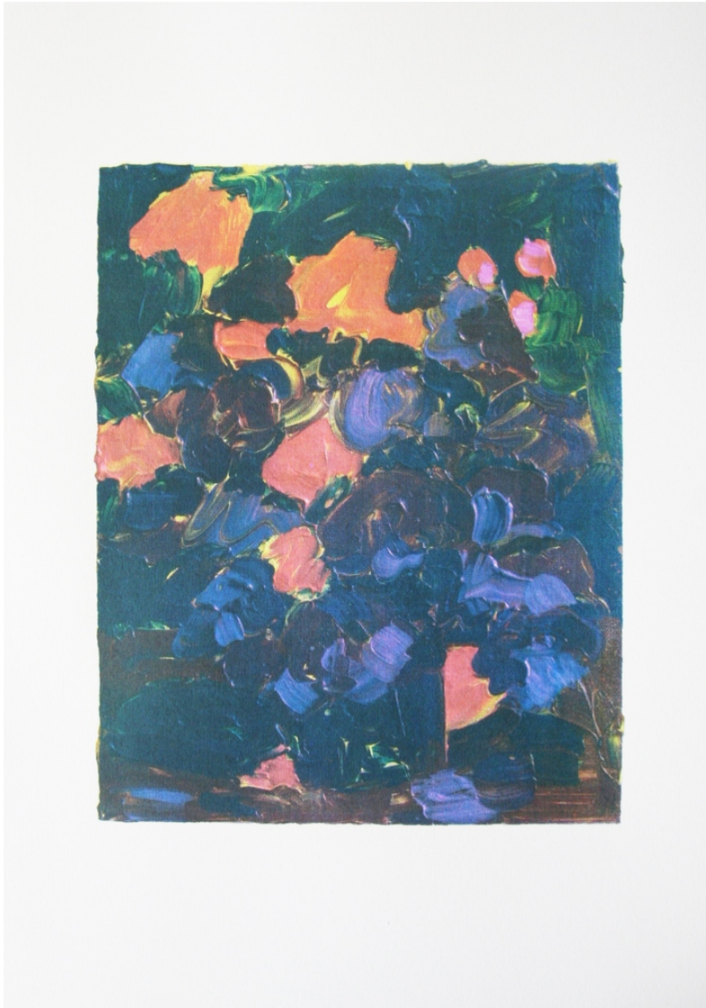
Untitled (Geranium) , Kirstin Carlin, Screen print (Edition of 20), 2014 484 x 343mm, printed at Ilam School of Fine Arts $300