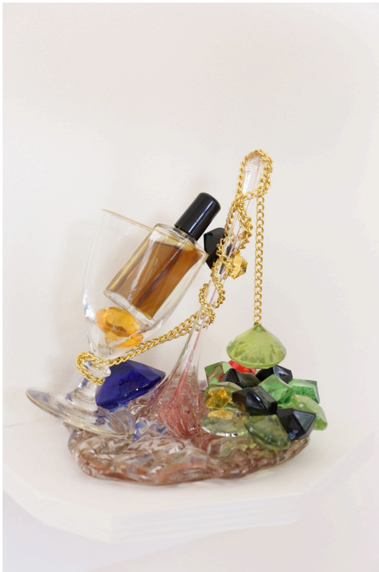
AMBUSH! , 20ml perfume produced by FLEURS DU MAL, unique sculpture-cum-perfume holder, 2017.