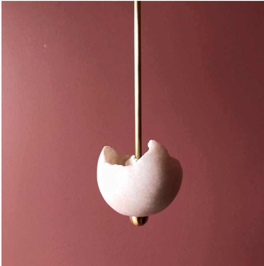
Albedo, Flavedo (X) , Steve Carr, marble and brass, 2016 Please note this is the last available work in a series of twelve. $3,000