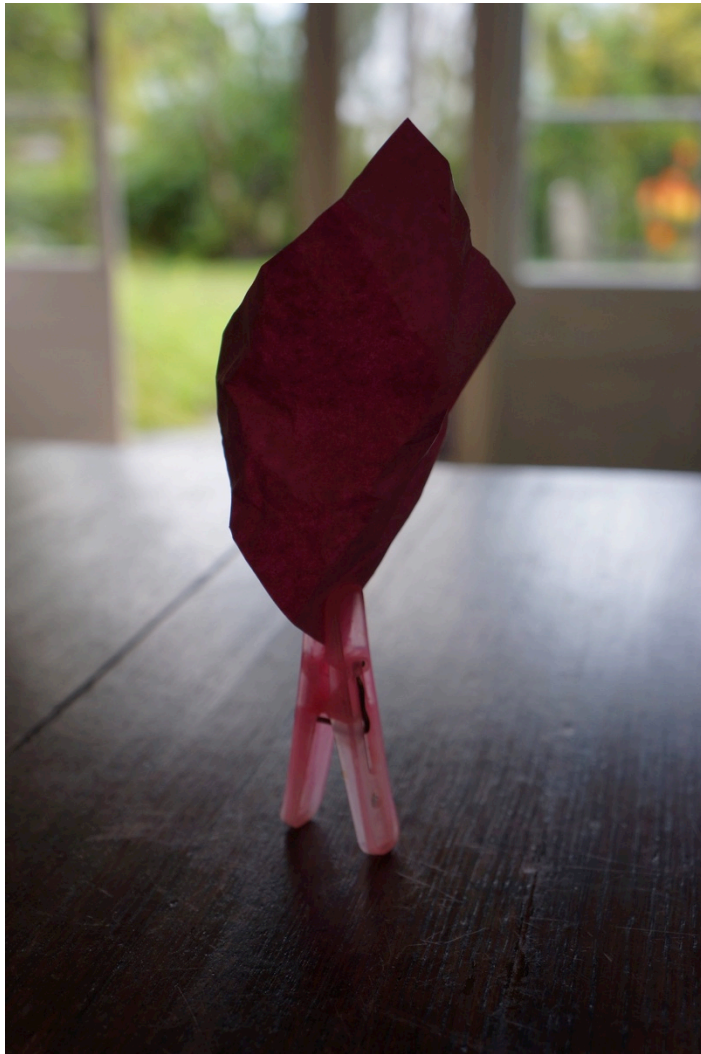
Untitled , John Ward Knox, Digital photograph (Edition of 20), 2014 225 x 150mm $300