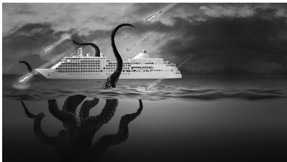
Image: Still from composite for a happiness that forgets nothing , Cushla Donaldson, 2018.